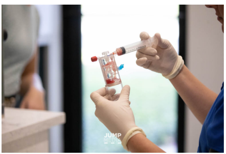
Self-derived biologic treatment combines naturally occurring growth factors and anti-inflammatory mediators, among other agents, that can improve the structure, strength, and speed of healing.

"Biologic agents found in the horse's own blood can be harvested, concentrated, and returned to the affected area of that same horse," explained Dr. Dubynsky. "This selfderived serum combines naturally occurring growth factors and antiinflammatory mediators, among other agents, that can improve the structure, strength, and speed of healing. In equine sports medicine, we commonly use regenerative therapies to treat musculoskeletal injuries and as a preventative therapy to proactively preserve joint health."